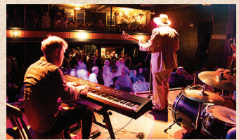
3 Old Confidence Lodge

A nature enthusiast's paradise. Here you will find more than 3km of white sand, rolling turf, fresh sea air, drumlin cliffs and breathtaking views. Categorized as a living beach because the beach moves and shifts at the whim of the ocean, Hirtle's Beach is ever changing. 318 Hirtle Beach Road, Kingsburg