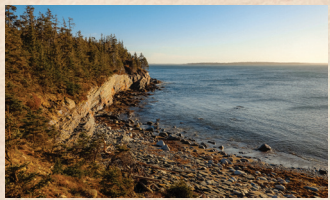
7 Gaff Point

A pleasant drive from anywhere in the region, Indian Falls offers a picnic area, on site privies, walking trail, rock beach and various look off points over the falls. Sit back, relax and listen as the waterfall roars and rumbles as it bounces off the rocks and flows down stream. 1585 Newburne Road, Newburne