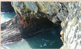
10 Ovens Natural Park

Discover the vibrant work of Peter Blais and Tom Always at their unique barn gallery and studio in Petite Rivière. Showcasing dramatic acrylic paintings on canvas and one-of-a-kind folk art, this captivating space offers a unique artistic experience. Visit them at 265 Petite Rivière Road or call 902-693-1544 for more information.