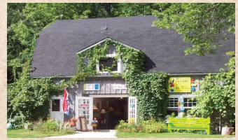
4 Maritime Painted Saltbox

Experience the delightful flavours at Ploughman's Lunch, a local bakery specializing in French pastries, organic sourdough breads, and bean-to-bar chocolate. Indulge in espresso, light lunches, and homemade soft serve ice cream. They also offer groceries and showcase local art. Located at 4645 Highway 331 West Dublin, Nova Scotia.