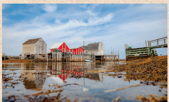
11 Blue Rocks

A stunning 2 km, crescent-shaped stretch of white sand near the community of LaHave. Popular with visitors throughout the summer, it's known for its scenic sand dunes and ideal conditions for windsurfing. The sand bar connects some of the LaHave Islands to the mainland.