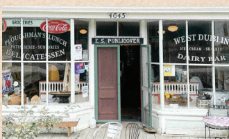
9 Ploughman's Lunch

Recently restored to its original art deco style, this performance venue serves as a cultural hub for the charming fishing village of Riverport. Visit on any given weekend to see world-class musicians, musical theatre shows or take part in their dance parties, karaoke and so much more. Open year-round and everyone is welcome. For current shows and events please check out www.oldconfidence.ca