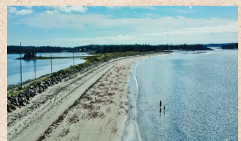
5 Crescent Beach

A privately owned 190 acre pristine reserve of coastal forest. Some of the highlights of the park season are the unique sea caves, tours, gold panning on Cunard's beach, the miner's museum and nightly entertainment by the fire. 326 Ovens Rd, Riverport 902-766-4621.