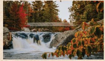
1 Indian Falls

A pleasant drive from anywhere in the region, Indian Falls offers a picnic area, on site privies, walking trail, rock beach and various look off points over the falls. Sit back, relax and listen as the waterfall roars and rumbles as it bounces off the rocks and flows down stream. 1585 Newburne Road, Newburne