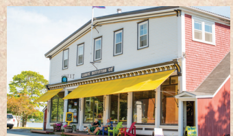
6 LaHave Bakery

Just six minutes from the Town of Lunenburg is the tranquil fishing village Blue Rocks, often dubbed "Lunenburg's answer to Peggy's Cove." Renowned for its striking blue slate rocks meeting the Atlantic, this coastal gem continues its fishing traditions while captivating artists and photographers alike. The iconic fish shack sitting in the water stands as one of the most photographed scenes in the area.