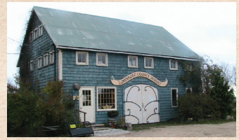
2 Lunenburg County Winery

A unique, unspoiled 124-acre headland where the LaHave estuary meets Hartling Bay, Gaff Point offers a scenic 6.5 km coastal hike through diverse marine, forest, and wetland ecosystems. The trail features dramatic cliffs, tidal pools, and secluded sand and gravel beaches. Access the trail via Hirtle's Beach at 318 Hirtle Beach Road