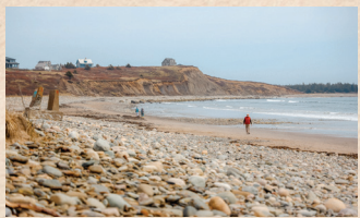
8 Hirtle's Beach

The winery sits on a drumlin surrounded by Acadian Forest and a multitude of lakes, in the community of Newburne. Known as Hackmatack Farm, a commercial blueberry farm, the winery has produced 100% Nova Scotia-grown, award-winning fruit wines. Visit, taste wine, pick berries, picnic and tour the winery. 813 Walburne Road, Newburne