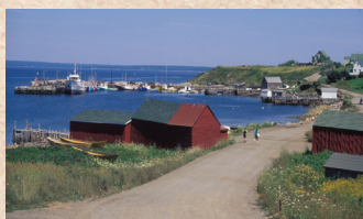
12 Tancook Islands

An old-style bakery located on the LaHave River waterfront. Reminiscent of an old general store, this authentic turn of the century shop is a big draw to the LaHave area. The bakery produces traditional breads made from locally grown, fresh milled grains offering a great selection of sweet and savoury treats. 3421 Highway 331, LaHave